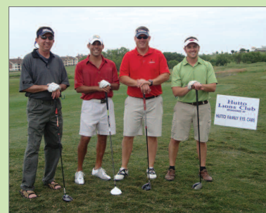
The Waste Management team at the Hutto Lions Club golf tournament

Waste Management was a sponsor of the Hutto Lions Club golf tournament, Hutto Athletic Booster Club golf tournament, and the Hutto Hippo 5K and 1K Runs.