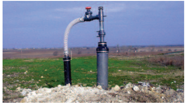
Gas extraction well collects landfill gas that is produced through the natural decomposition of waste.

The new gas system is operational, collecting and removing landfill gas that is created naturally by the decomposition of waste. The gas is destroyed safely at a central, high-temperature flare. The gas system helps control potential landfill odors, reduces the potential for off-site landfill gas migration, and minimizes passive landfill gas emissions.