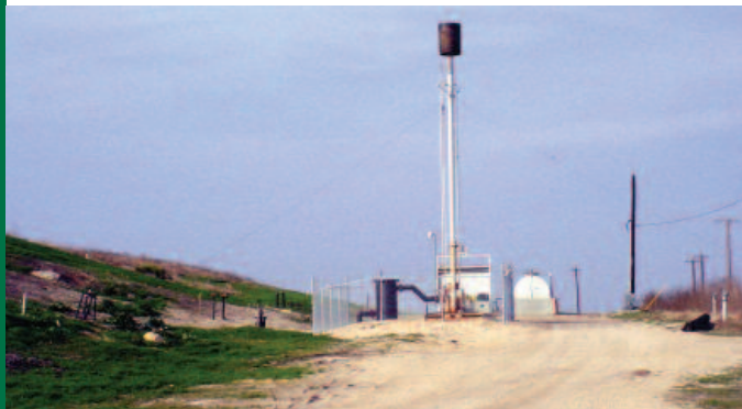
Landfill gas is safely destroyed at a high-temperature flare.

In other landfill news, Waste Management planted Red Tip Photinia shrubs used for landscape screening at the Recycling Center.